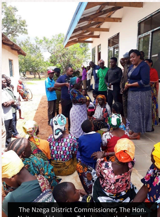
The Nzega District Commissioner, The Hon. Naitapwaki Lemeya Tukai opens the lyombo classroom for children with special needs.

These two projects costing around £15,000 each will use the bulk of our available funds, but we will nevertheless continue with our annual grants of £2,000 to each of the Folk Development Colleges at Mwanhala, Sikonge and