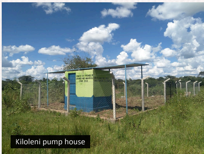
Kiloleni pump house

for, without you we could do nothing. Please continue your giving and, if you can, join in one of the two sponsored walks being held this summer (see page 10).