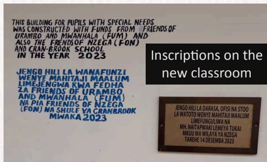
Inscriptions on the new classroom

but everything we do is dependent on two things: