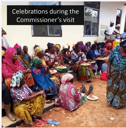
Celebrations during the Commissioner's visit