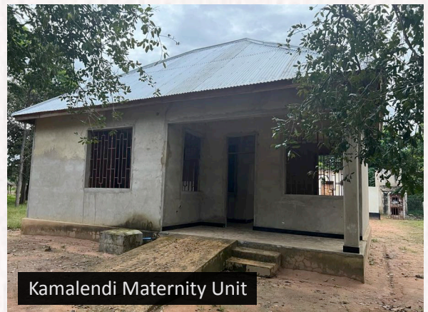
Kamalendi Maternity Unit