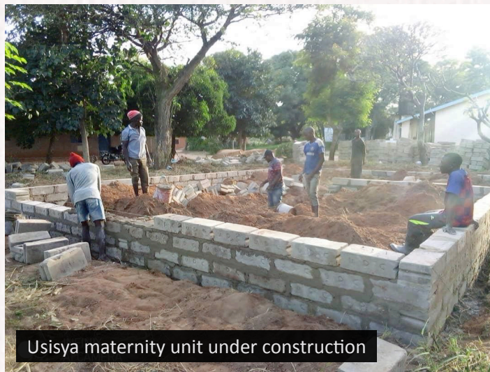
Usisya maternity unit under construction

The Usisya Dispensary is 20km east of Urambo, close to the new tarmac road. It was built by the villagers, with help from Urambo District Council and opened in 1989 and now serves a local population of over 19,000 people, of whom (in 2021) 5,980 were under the age of 5 years and 1,196 were under the age of one year (according