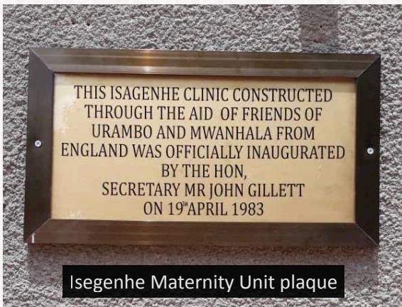
Isegenhe Maternity Unit plaque

Forty years passed and the memorial plaque was looking very sad. As do all our supported villages, Isegenhe values its link with FUM which it wants recognised and so a