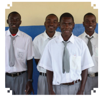
Imeli School Bursary Students

If you would like your gift to be used for a specific purpose we suggest you contact the secretary of FUM on 01580 291 969 or by emailing secretary@fum.org.uk to discuss this in detail.